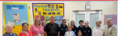
Year 6 at Five Ashes CEP School did a great job helping our Open the Book team on Thursday!

Please do get in touch if you are in the area.