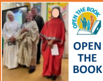
Five Ashes CEP

SATURDAY PICNICKERS 12.30-2.30 London House ALL WELCOME!