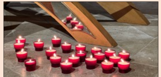
Candles in memory of loved ones - last Sunday evening