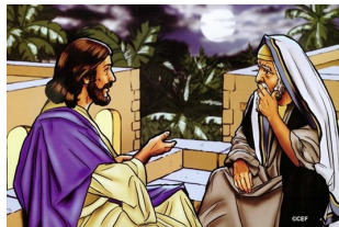
Nicodemus goes to talk to Jesus

Be present, Holy Spirit, as we declare our faith, Trinity in unity, God Almighty, Father, Son and Holy Spirit. Amen.