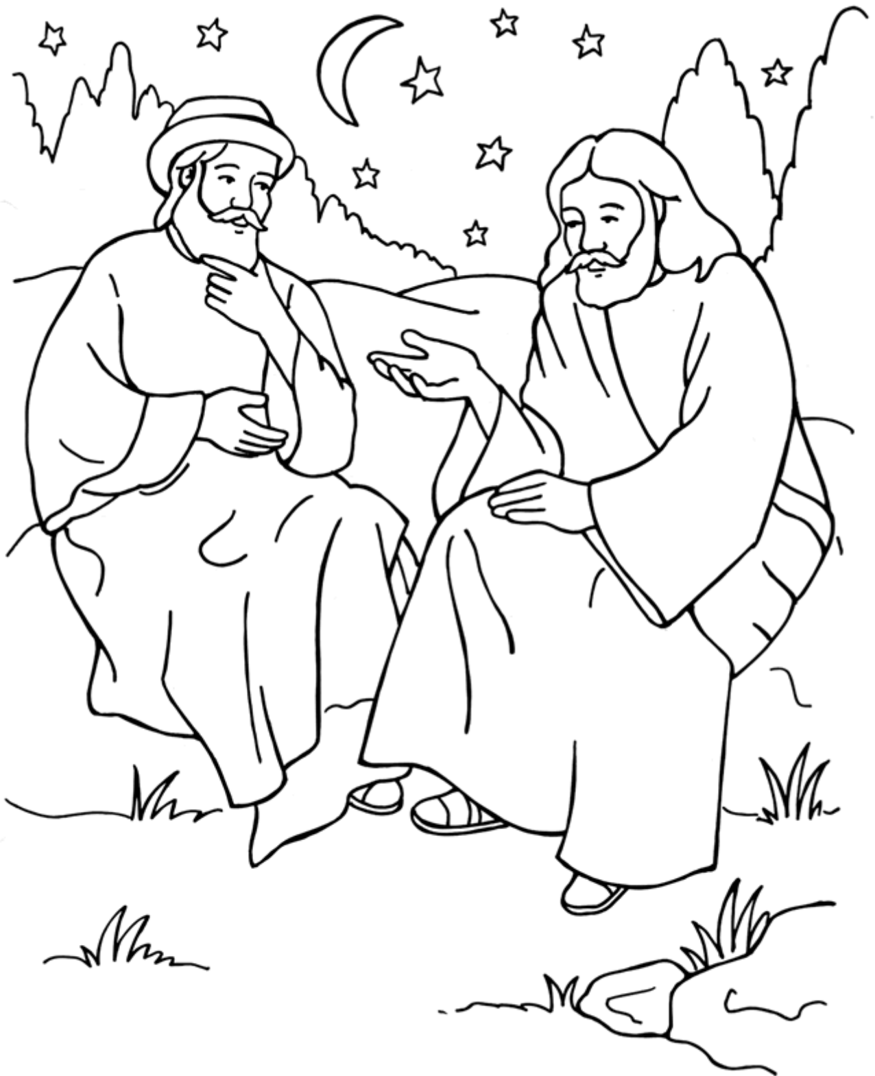
Jesus and Nicodemus John 3