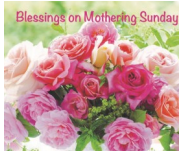
1 Samuel 1: 20-end Luke 2: 33-35

Lord Jesus, bless all mothers and carers today and everyday and all who act like them by taking such good care of others. Give them rest when they're tired, and help us to show them the love we feel for them inside every day around the clock. Amen.