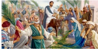
Philippians 2 verses 5 - 11 Mark 11 verses 1 - 11

Holy Spirit, we pray that you would open the hearts and minds of all those who do not yet know you, that they would recognise Jesus, the promised king. Amen.