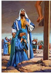
Colossians 3: 12-17 John 19: 23-27

Lord Jesus, bless all mothers and carers today and everyday and all who act like them by taking such good care of others. Give them rest when they're tired, and help us to show them the love we feel for them inside every day around the clock. Amen.