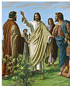
Romans 1: 1 – 12 Matthew 9: 35 – 10 : 8

We pray that God's wonderful story will be heard and known in all the world. Amen.