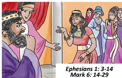
Ephesians 1: 3-14 Mark 6: 14-29

Dear God, help us to stand up for what is right, and stand firm, even when people try to persuade us to do wrong. Amen.