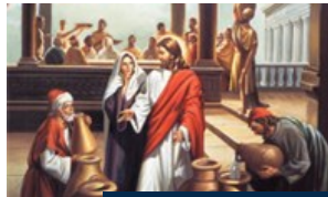
John 2: 1-11

Help us to always remember who Jesus is. We pray in Jesus' name, Amen.