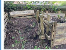
Community composting in the churchyard

While climate change can seem daunting, every action counts. We invite you to join us on our Eco-Church journey to make a positive impact, care for the environment, and help build a stronger, more resilient future for all. Together, we can make a difference.