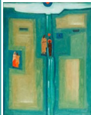
Icon: The Baptism of Jesus Christ in the Jordan , 1964 Jerzy Nowosielski (Polish, 1923–2011),