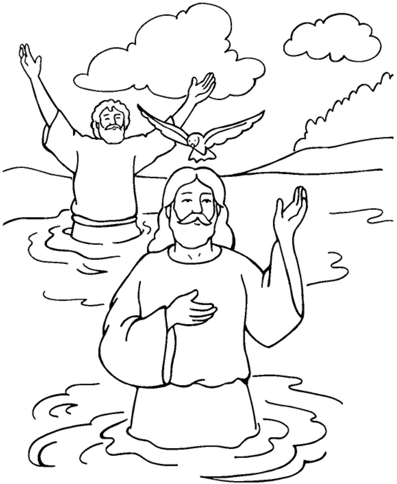
A picture for you to colour