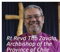
Rt Revd Tito Zavala, Archbishop of the Province of Chile

We are asked to pray for the Anglican Church of Chile and for the Bishop's Council setting policy & strategy for the Diocese. The Church was inaugurated as the 40th Province of the Anglican Communion in November 2018 (see https://youtu.be/epRpSrJkvH8 ). Chile is one of the destinations sought by persons fleeing human rights violations in Venezuela. In March 2023, Amnesty International warned that denying these people access to the procedure to be recognized as refugees puts them at serious risk of being returned to places where their lives and rights are under threat. (See https://www.amnesty.org.uk/urgent-actions/refugees-and-migrants-face-criminalization )