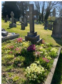
Springtime in the Churchyard

We are very pleased to announce that services have resumed at the CHAPEL OF THE GOOD SHEPHERD in FIVE ASHES . These will be held at 12 noon on the 2nd and 4th Sundays of each month.